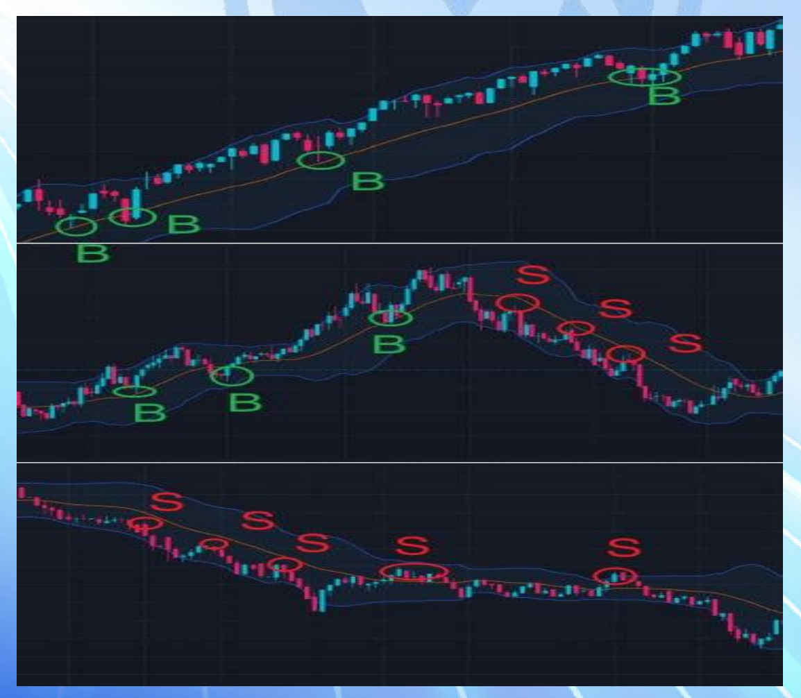
FB Finance Institute - 15th Session

If you encounter any obstacles or issues, please feel free to communicate with us. We will work together to solve problems, optimize strategies, and seize opportunities.